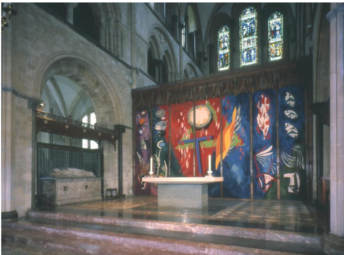
Common Worship – Order 1 (contemporary language)

There are no announcements during this service. Members of the congregation and choir are provided with a booklet containing full details of the service, including readings and hymn numbers, and a hymn book. The instructions below will serve as a guide until you have the confirmed order of service which you will be sent a couple of weeks in advance.